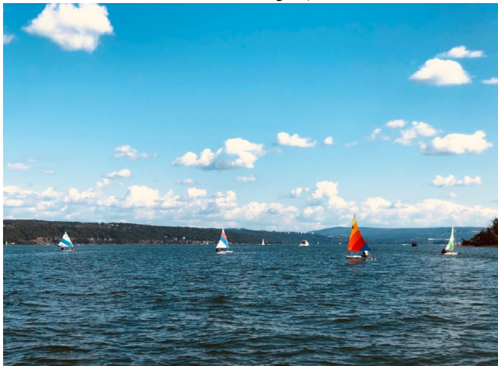
Photo 1: Katie's campers in Sunfish sailing on Cayuga Lake – full sails despite shifty winds and avoiding other boat traffic!

Most recently in 2021, I worked as crew aboard S/V True Love , a 67-foot wooden schooner offering sailing charters out of Seneca Harbor. This position allowed me to gain experience on a boat much larger than any vessel I have been aboard before. While the charters seem pretty routine, every day is a bit different – different wind, different weather, different passengers. The tourists on board LOVE to test the crew's knowledge – on the boat, on the lake, on the physics of sailing – all of it. Again, for many of the passengers, it is their one time to be on a sailboat and they want to have a valuable and enriching experience. (How much of it they remember depends on how many times I refill their wine glass, but I've digressed.)